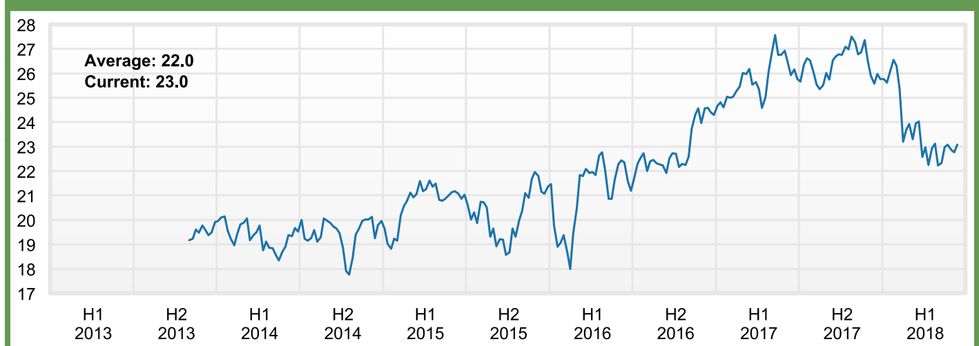
ROBO Global Robotics & Automation Index - ntm PE

As a result, the ROBO Global Robotics & Automation Index is trading on a 12-month forward PE of 23x, compared to 27x a year ago. This represents a 5% premium to the 22x average since inception of the index in 2013.